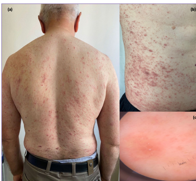
Figure 1. a) Symmetrical arrangement of violaceous papules and plaques on the back. b) Scaly, violaceous papules and plaques on the left flank. c) Dermoscopy: erythema, brownish pigmentation, dotted vessels, scales

scales whereas Wickham's stria was not observed. (Figure 1C). The differential diagnoses included LDE, LP, pityriasis rosea and secondary syphilis. Routine laboratory tests revealed no pathologic