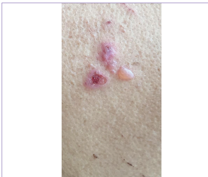
Figure 1. Intact bullae

methylprednisolone was stopped after 15 days because the patient developed insulin dependent DM, accordingly azathioprine was stopped because of high liver enzyme levels. Tetracycline tablet 500 mg dialy was started but after one month the patient complained of severe nausea and we had to stop tetracycline treatment, too. Extensive vesicles and bullaes became on her body (Figure 2). We didn't think BP due to drugs, because when metformin had been stopped and switched to insulin, BP of the case continued. Intravenous Ig (IVIG) treatment was started for the patient whose laboratory findings were normal except Hgb level of 10.6 gr/dL. After 6 doses of IVIG, the patient healed completely, there were no pruritus and no skin findings but after two months pruritus, vesicles and bullaes came back. Rituximab at a dose of 500 mg was given to the patient two weeks apart but clinical response wasn't received. Tetracycline tablet 500 mg daily and nicotinamide ampul 12 mg weekly were started in addition to the current treatment of the patient and nausea didn't occurred. Now our patient is in the second month of tetracycline and nicotinamide treatment and she is in remission (Figure 3). Accordingly she took 10 doses of IVIG but