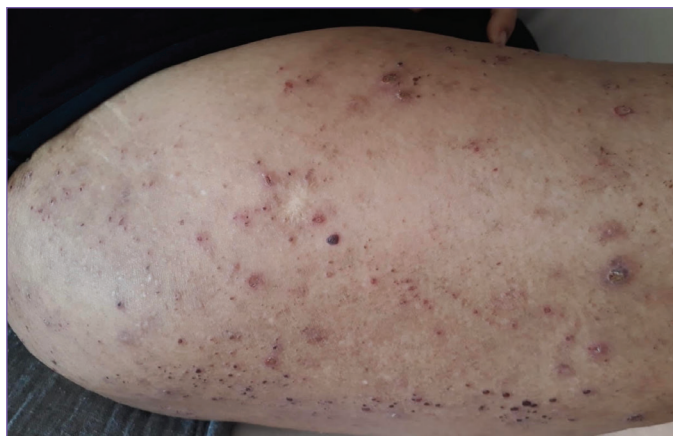
Figure 2. Excoriations, erosions, crusts

methylprednisolone was stopped after 15 days because the patient developed insulin dependent DM, accordingly azathioprine was stopped because of high liver enzyme levels. Tetracycline tablet 500 mg dialy was started but after one month the patient complained of severe nausea and we had to stop tetracycline treatment, too. Extensive vesicles and bullaes became on her body (Figure 2). We didn't think BP due to drugs, because when metformin had been stopped and switched to insulin, BP of the case continued. Intravenous Ig (IVIG) treatment was started for the patient whose laboratory findings were normal except Hgb level of 10.6 gr/dL. After 6 doses of IVIG, the patient healed completely, there were no pruritus and no skin findings but after two months pruritus, vesicles and bullaes came back. Rituximab at a dose of 500 mg was given to the patient two weeks apart but clinical response wasn't received. Tetracycline tablet 500 mg daily and nicotinamide ampul 12 mg weekly were started in addition to the current treatment of the patient and nausea didn't occurred. Now our patient is in the second month of tetracycline and nicotinamide treatment and she is in remission (Figure 3). Accordingly she took 10 doses of IVIG but