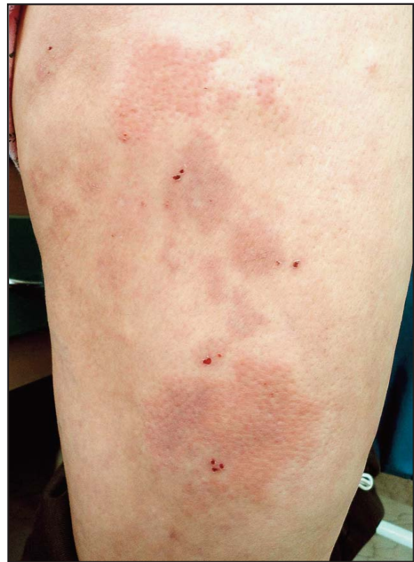
Figure 2. Closer appearance of the annular and plaques lesions on the lower extremity

zole for DM and antral gastritis which she had started using 3 years before she applied to us.