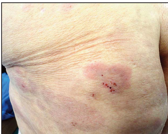
Figure 3. Closer appearance of the annular lesion and bluish macules on her gluteas

months after the onset of metformin, olmesartan medoxomil and hidroclorotiazid therapies. Her other medications included insulin and lansopra-