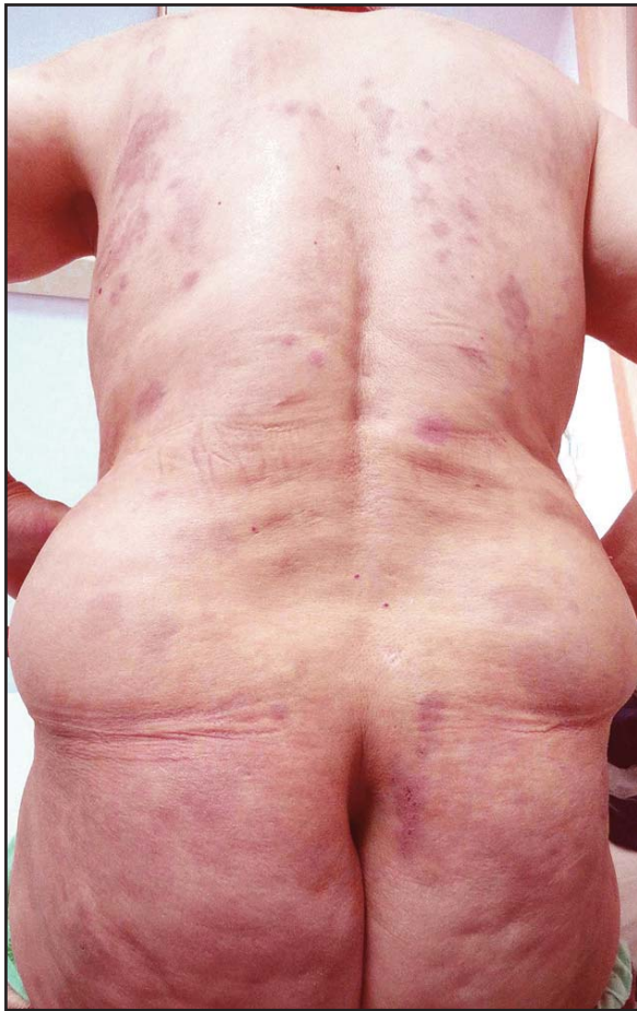
Figure 1. Indurated red/bluish papules and various sized plaques. Some of them are annular shaped with erythematous indurated borders and bluish hue on the centers

months after the onset of metformin, olmesartan medoxomil and hidroclorotiazid therapies. Her other medications included insulin and lansopra-