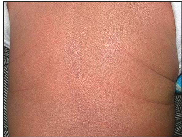
Figure 2. Peau d'orange like skin on the trunk

laboratory investigations including complete blood count, erythrocyte sedimentation rate, urinalysis, histamine in urine, serum chemistry profile, Ig E and bone marrow aspiration were within the normal range or negative. No abnormal data could be seen in his abdominal and pelvic sonography. The culture from the blister was negative. Skin biopsy from a lesion showed a dense dermal cellular infiltrate identified as mast cells by toluidine blue staining ( Figure 3A, 3B ). The direct immunofluorescence was negative. The diagnosis of bullous mastocytosis was made based on these clinical and histopathological findings. The patient was treated with H 1 and H 2 blockers (hydroxyzine and ranitidine) and ketotifen to which there was no sa-