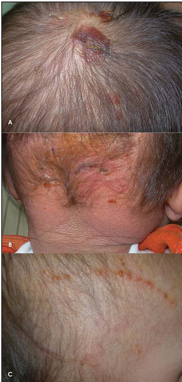
Figure 1A, 1B, 1C. Multiple tense vesicles, bullae, erosions and hemorrhagic crusts on the scalp.

laboratory investigations including complete blood count, erythrocyte sedimentation rate, urinalysis, histamine in urine, serum chemistry profile, Ig E and bone marrow aspiration were within the normal range or negative. No abnormal data could be seen in his abdominal and pelvic sonography. The culture from the blister was negative. Skin biopsy from a lesion showed a dense dermal cellular infiltrate identified as mast cells by toluidine blue staining ( Figure 3A, 3B ). The direct immunofluorescence was negative. The diagnosis of bullous mastocytosis was made based on these clinical and histopathological findings. The patient was treated with H 1 and H 2 blockers (hydroxyzine and ranitidine) and ketotifen to which there was no sa-