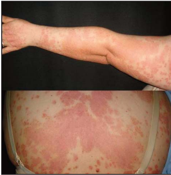
Figure 1. Erythematous plaques with limited silvery scale on arm and trunk

low-up, psoriatic lesions resolved and thrombocyte count approached to normal limits.