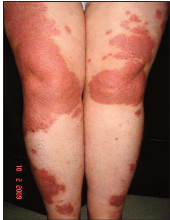
Figure 2. Erythematous plaques with limited silvery scale on legs

an association [7]. In our patient, ANA was found to be as 1/320 together with an elevated anti-Ro antibody level. Besides the ANA positivity, photosensitivity, presence of anti-cardiolipins, thrombocytopenia established the diagnosis of SLE in our patient according to the ARA criteria [8].