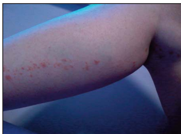
Figure 2. Linear-distributed lesion that formed of pink-purple papules