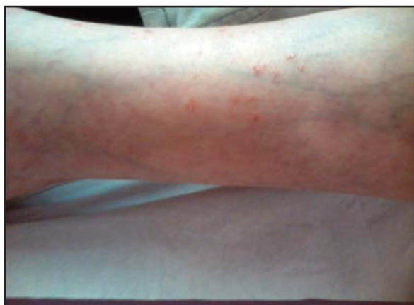
Figure 1. Pink-purple lichenoid papules on the leg