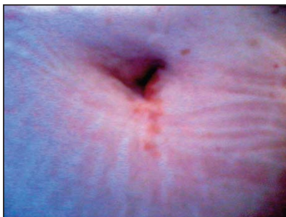
Figure 3. Pink-purple lichenoid papules arranged as a linear pattern