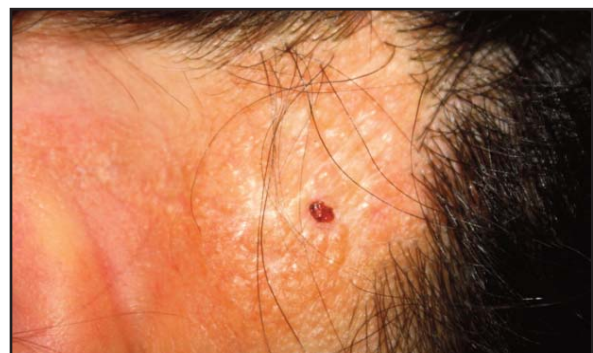
Figure 1. Multiple yellowish papules coalescing to form plaques on the left postauricular region (4 mm-punch biopsy site is seen on the middle of the plaque)

A 20-year-old female presented with asymptomatic skin lesions in the postauricular area for 2 years. She was otherwise healthy. Dermatological examination revealed multiple yellowish papules coalescing to form plaque on the left postauricular region (Figure 1). A 4-mm-punch biopsy was made from one of the yellowish papules which revealed hyperplastic sebaceous glands (Figure 2). The diagnosis was sebaceous hyperplasia en plaque.