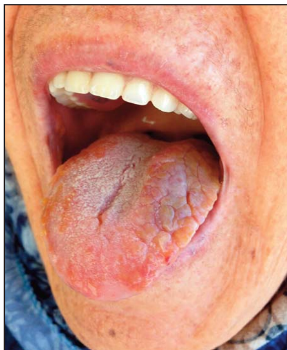
Figure 2. Primary systemic amyloidosis with involvement tongue

areas accompanying asymptomatic yellowish papules and inside the lower lip are observed ( Figures 1 and 2 ). Gray-brown papular lesions were seen on the gluteal region and around the anus ( Figure 3 ). Hematoxylin and eosin staining was demonstrated intense eosinophilic amyloid deposition that is characterized with long and thin cleavages; from the dermal biopsy obtained from tongue, internal part of lower lip and gluteal area. In the immunohistochemistry positively staining with Congo red, AL amyloid accumulation with orange and light brown colors and typical image of amyloid with apple-green color staining, under polarized light has been showed ( Figures 4a, b and c ). Amyloid deposits in abdominal subcutaneous fat biopsy performed negative. Complete blood count tests (platelet: 376 \times 10^9/l , leucocyte: 10 \times 10^9/l , sedimentation: 38 \text{ mm/hour} ) increased borderline. Biochemical tests included serum albumin, globulin, lactic dehydrogenase, calcium, renal and liver function tests, and posterior anterior lung graphy were evaluated as normal. Mild proteinuria identified on 24 hours urine test with result of 20 \text{ mg/dl} (Normal: 1-14 ). In serum and 24-hour urine immunofixation electrophoresis confirmed immunoglobulin kappa light chain mo-